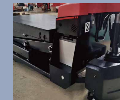
The batteries can be removed conveniently, for easier maintenance and disassembly