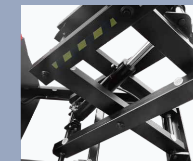
Double scissors structure, rectangular tube profile, more stable and stronger