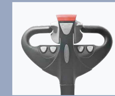
Multi-function handle, reliable, beautiful and simple, all functions can be completed with one hand