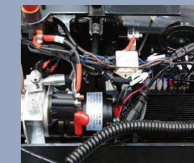
One-piece cover, covering almost all important components, convenient for maintenance