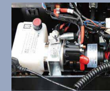
Integrated hydraulic unit, compact structure, less space