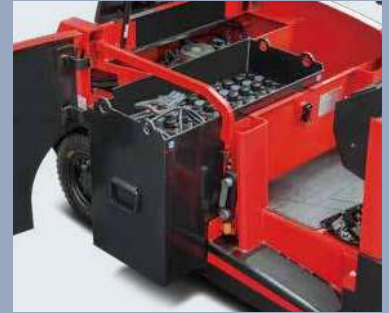
Battery side roll out is taken as the standard configuration in order to easily and fast replace the battery