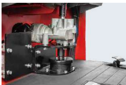
Electronic power steering system (for stand-up driving type tractor)