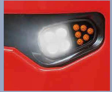
Reliable LED lighting