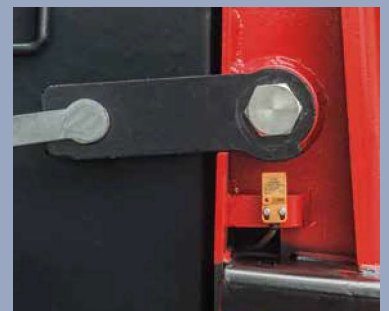
The locking device of the battery is provided with the safety protection function. Only if the locking device is rotated in place, the tractor can travel