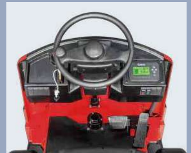
Modern outline design with LCD instrument and USB charging port