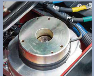
Electrical Park Brake (EPB) system