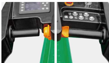
Right and left hand sensing