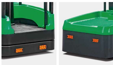
Front and rear flashing lights