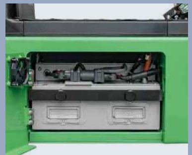
Lithium battery pack