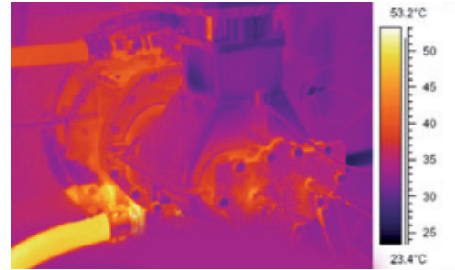
Limited temperature increase of only 25° C inside compressor element

Adiabatic compression: All compression heat is transferred to the compressed air (~ dry screw technology)